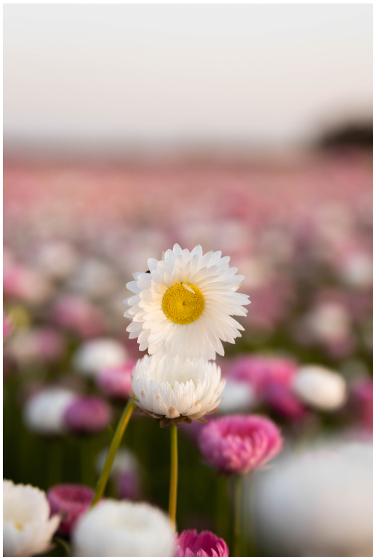
How beautiful are these by images @wanderingsoulphotos 🥰