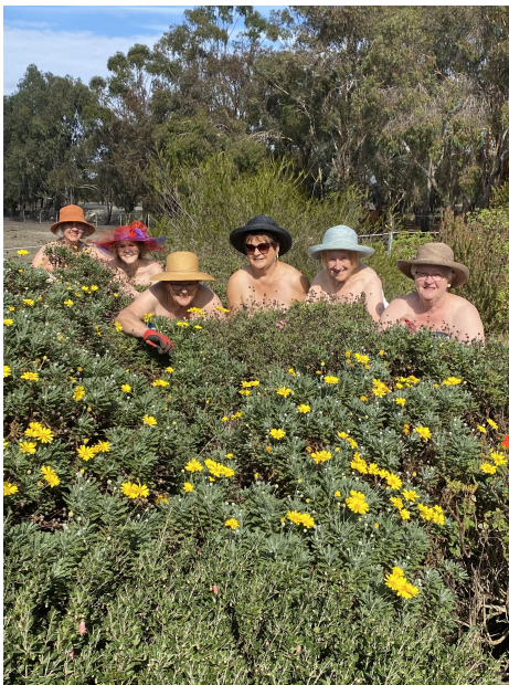
Katanning Garden Club ladies ❤️🌸