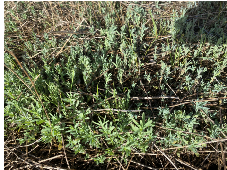
This is our everlasting crop, germinating in March after the first rains. It has come up beautifully, self-seeding from the 2022. We will plant another crop soon.