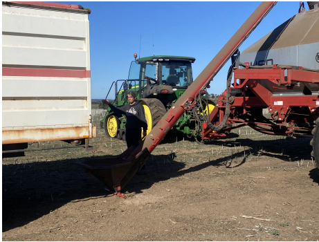
This is our airseeder box, filling up with seed and fertiliser. Here we are seeding canola at our Frankland property.