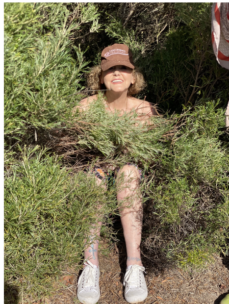
Katanning garden club ladies having a bit of fun for the International Naked Gardening Day! Lucky the morning was warm and sunny!