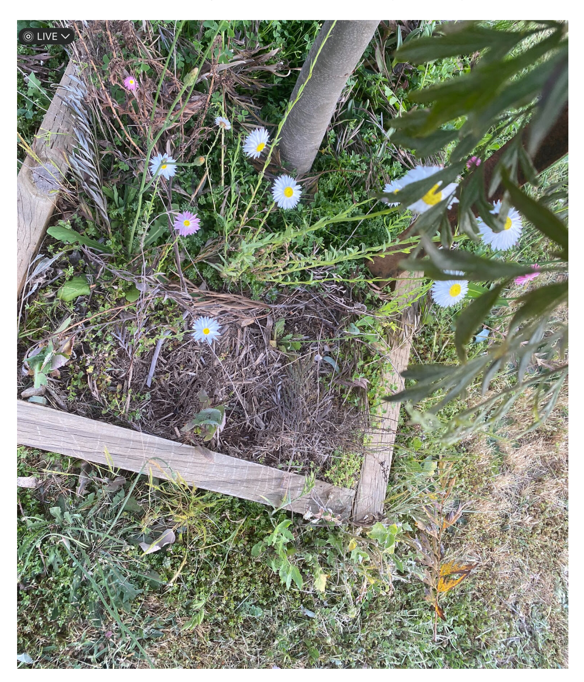
Tip 5: Control Snails as you Plant

NOTE: In the picture above, there is lots of ryegrass. Remove it by either digging it up and turning over, or spraying with Roundup. If the grass has come up in your everlastings, you have chemical options to use a grass selective herbicide. Ask your nursery