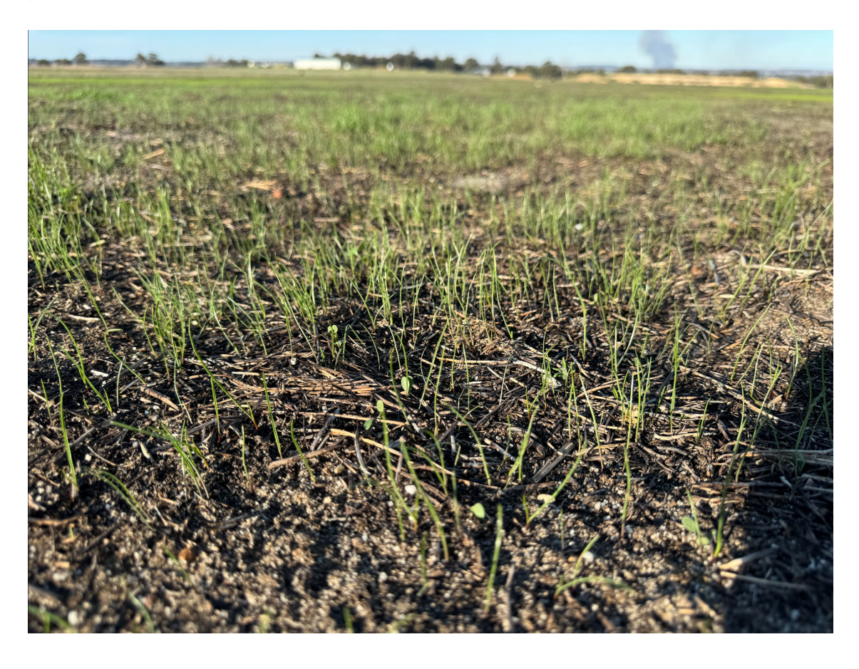
Tip 4: Control Weeds Before You Plant! Weed control is crucial for the successful growth of your Everlasting flowers. Weeds

When planting, loosen the soil with a shovel to allow for proper root growth. You could also mix in some organic matter such as compost, to improve the soil's fertility and drainage if you'd like!