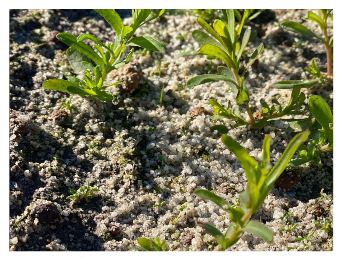
Tip 3: Loosen Soil if Hard

When planting, loosen the soil with a shovel to allow for proper root growth. You could also mix in some organic matter such as compost, to improve the soil's fertility and drainage if you'd like!